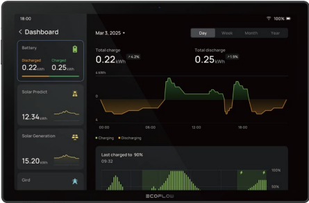
Battery Charge and Discharge