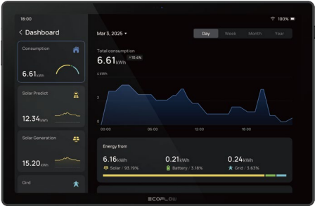
Home Energy Consumption